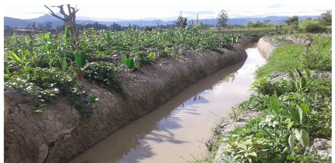
Figure 1. Wen Mina Hipere Farming System

Wen Mina Hipere is a new method of agriculture in the Dany community. The system of sweet potato farming (hipere) that has developed in the Dani community is enhanced by the introduction of fish farming technology (mina) in the trenches of the potato garden. Wen Mina Hipere, modified through the construction of a large moat which acts as a barrier to the wild pigs, is technically qualified to grow freshwater fish while fish feed utilizes the leaves of sweet potato and cattle waste. Dual advantages obtained by the farmers are the increase in production of sweet potato and a source of protein from fish harvests.